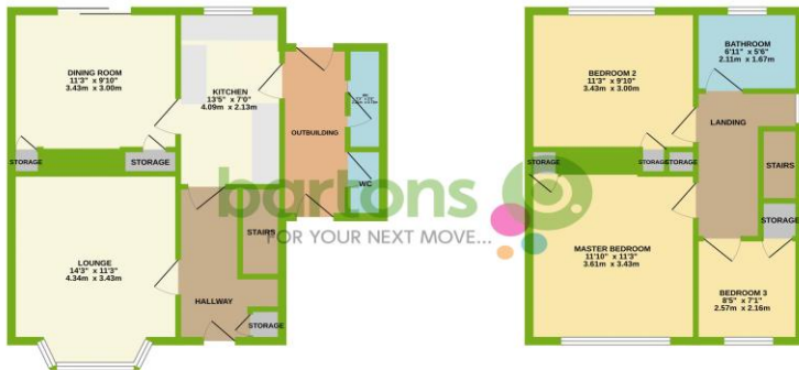
1ST FLOOR 420 sq.ft. (39.0 sq.m.) approx.

TOTAL FLOOR AREA: 934 sq.ft. (86.8 sq.m.) approx. Whilst every attempt has been made to ensure the accuracy of the floorplan, measurements of doors, windows, rooms and any other items are approximate and no responsibility is taken for any error, omission or misstatement. This plan is for illustrative purposes only and should be used as such by any prospective purchaser. The services, systems and appliances shown have not been tested and no guarantee can be given as to their operability or efficiency on the date shown. Made with Metreplan (2023)